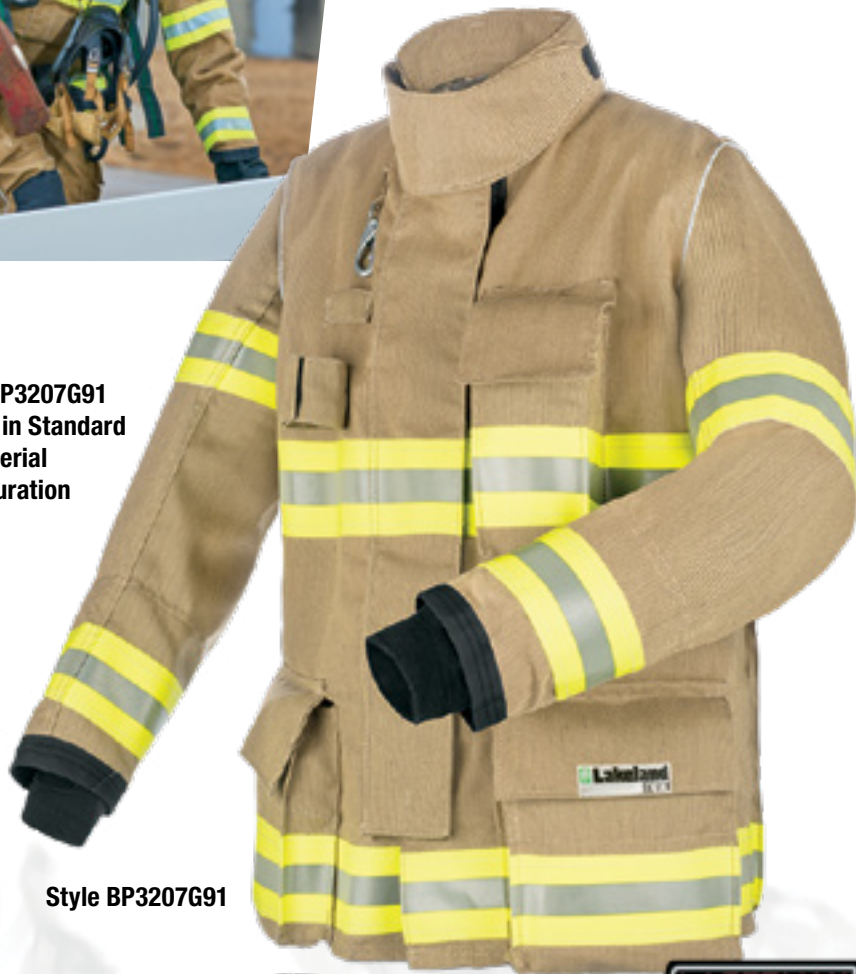
Style BP3207G91 shown in Standard B2 Material Configuration