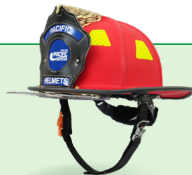
F18H HALOFLEX™ HELMET

To see why the F18H makes a difference, it helps to look at where other traditional helmets fall short and how those gaps affect crews on every shift.